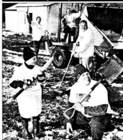
Snow hampers pavilion work