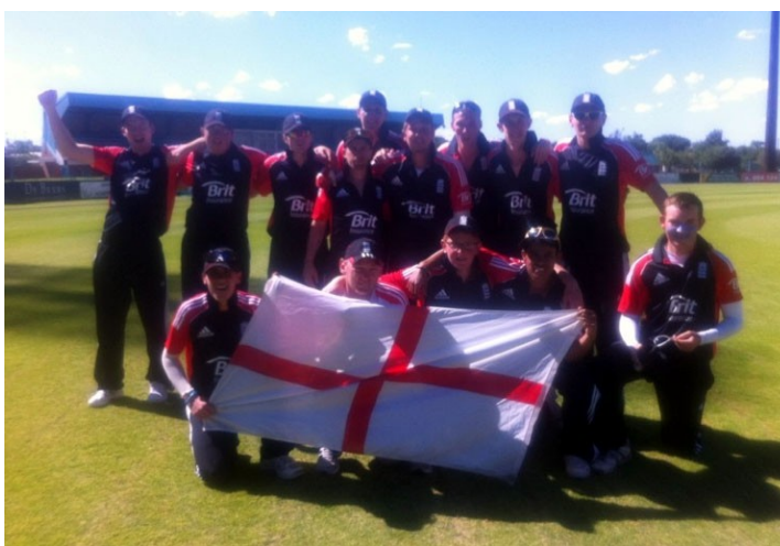
England LD Squad After Being Crowned Tri Series Champions