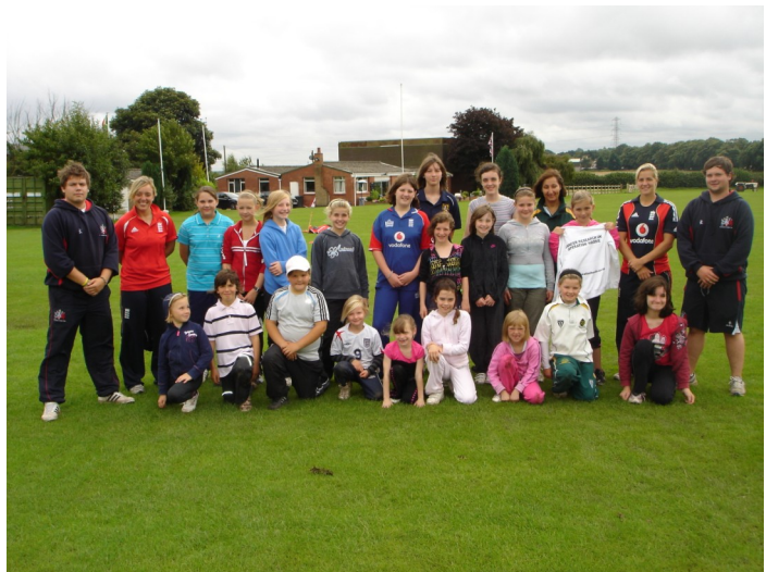
Women’s and Girls Cricket in Staffordshire is increasing helped by visits to the county like the one above from England players Danielle Hazell and Katherine Brunt seen at last years visit to a girls only camp at Tamworth Cricket Club